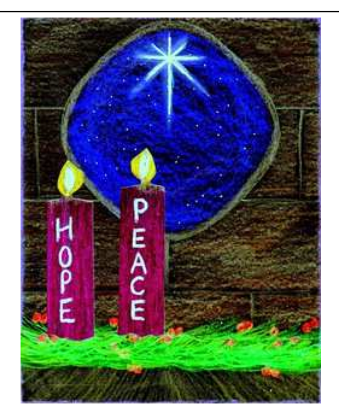
The "R's" of Advent - Part 2

In unity, the mission of the Millcreek Community Church is to serve God, help those in need and live by faith and love.